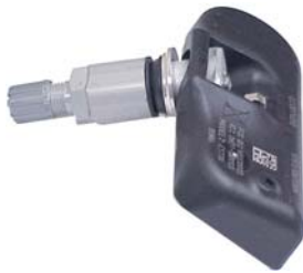
Dill P/N 1051