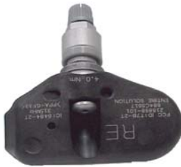
Dill P/N 1057