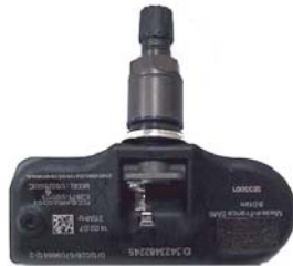
Dill P/N 1053