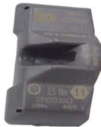
Dill P/N 9001